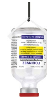
Ready to hang for IV administration